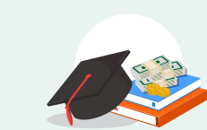
Student debt relief

On the other hand, employers find them to be a solution to absenteeism and presenteeism . Some examples include: